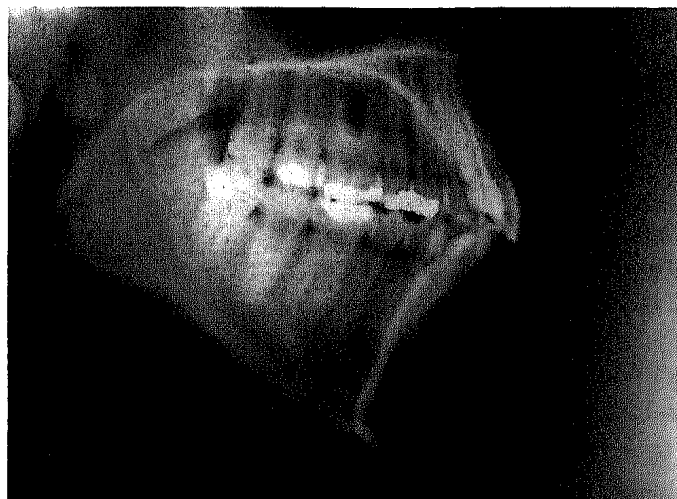
Figure 2. A lateral mandibular radiograph showing an area of 0.5 mm of cephalic resorption at the suprapogonion (arrow) 12 months after surgery.